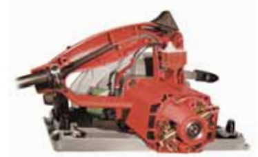
Circular saw. Schunk carbon brushes also guarantee a long operating life at high rotational speeds

Drills and compact rotary hammers. Long service life of the carbon brushes as well as easy servicing are required