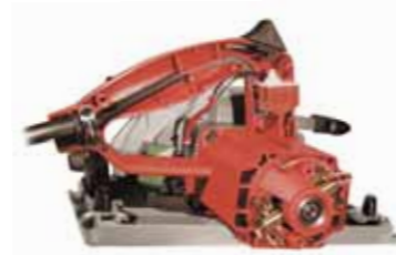
Circular saw. Schunk carbon brushes also guarantee a long operating life at high rotational speeds