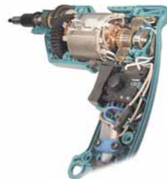
Drills and compact rotary hammers. Long service life of the carbon brushes as well as easy servicing are required